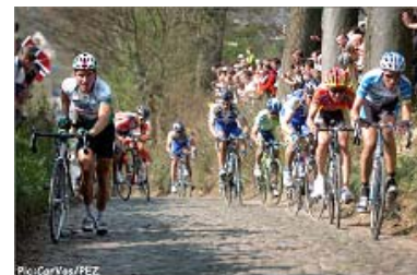
There's a good chance that if the pros are walking it's going to be ridiculous.

The next climb wasn't for some time so we re-grouped and carried on at a sensible pace. This was, of course, until the first section of flat cobbles. There are 4 of these in the ride, each of a couple of kilometres in length.